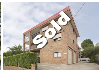
Hunter St, Woolloowin Sold to an Investor