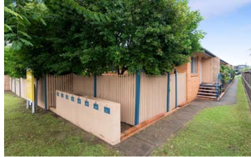
3/61 Junction Rd, Clayfield-$270,000 2 bed, 1 bath, 1 car, Rental $290