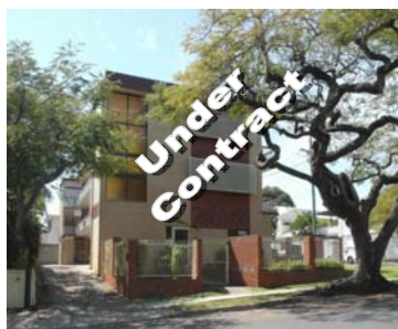
Franz Rd, Clayfield Sold to an Investor