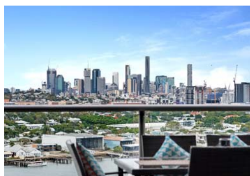
31512/2 Harbour Rd, Hamilton-$699,000 2 bed, 2 bath, 2 car, Rental $550