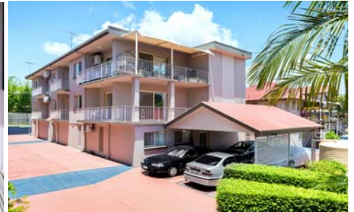
13/483 Sandgate Rd, Albion $295,000 2 bed, 1 bath, 1 car Rental $340