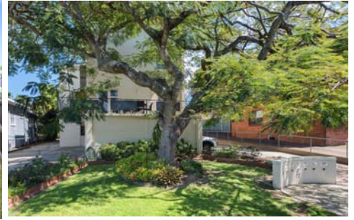
3/72 Riverton St, Clayfield-$369,000 2 bed, 1 bath, 1 car, Rental $330