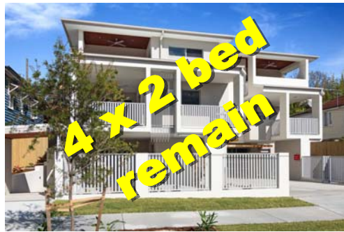
30 Olive St, Nundah From $395-$525K 4 x2 bed + 1 x 1 bed remaining