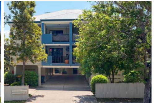
7/51 Junction Rd, Clayfield $395,000 2 bed, 2 bath, 1 car Rental $400