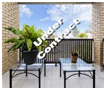
Butler St, Ascot Sold to an Investor