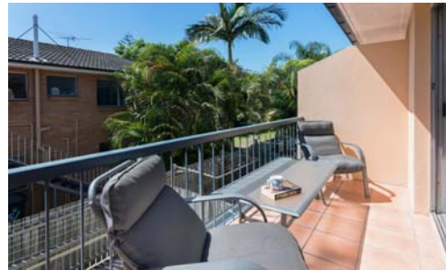
5/92 Eton St, Nundah-$359,000 2 bed, 2 bath, 1 car, Rental $340