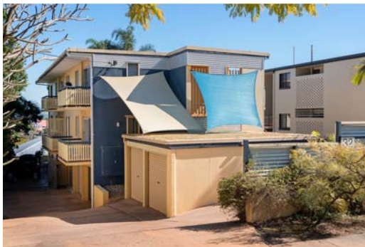
3/32 Miles St, Clayfield - $469,000 3 bed, 2 bath, 2 car, Rental $380