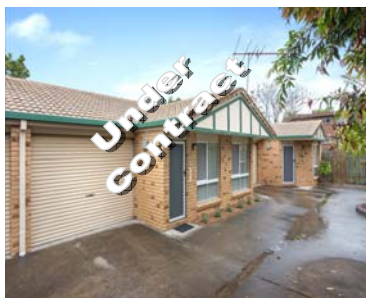
Little Jenner St, Nundah Owner moving in